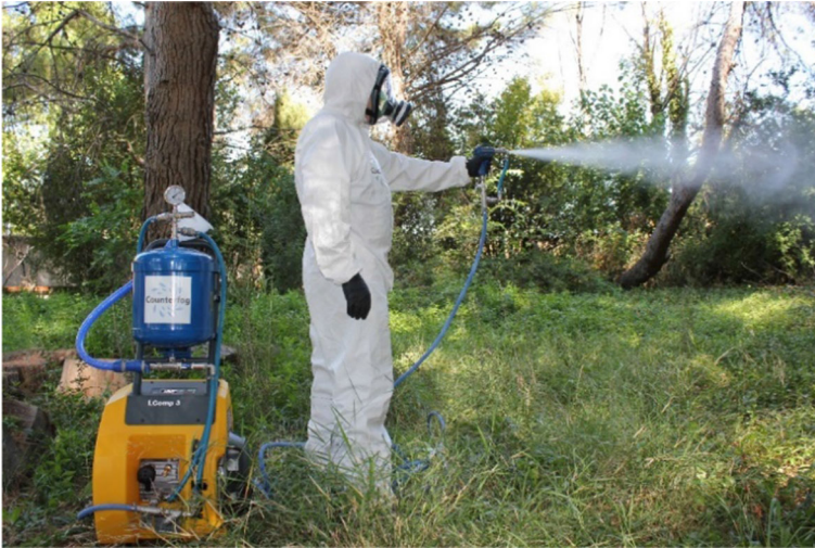
Fig. 3 Operator using disinfection COUNTERFOG® SDR-F05A+ device

An SDR-F05A+ nozzle was horizontally fixed on a tripod. The very end of the nozzle was taken as origin of coordinates. A digital anemometer Kestrel 3000 was used to measure fog velocity along its horizontal axis as well as at different peripheral points around the axis of the fog cone. The criteria to define the border of the cone was based on the axial component of the velocity. Points with axial velocity under 0.1 m/s are considered out of the cone.