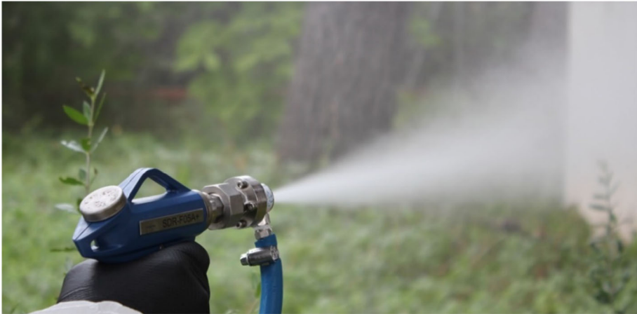
Fig. 1 COUNTERFOG® dynamic fog cone

Therefore, a key for success when fighting against transmission of the pandemic is to effectively disinfect both surfaces and air wherever people can be exposed to—including buildings, vehicles, facilities, etc. [2].